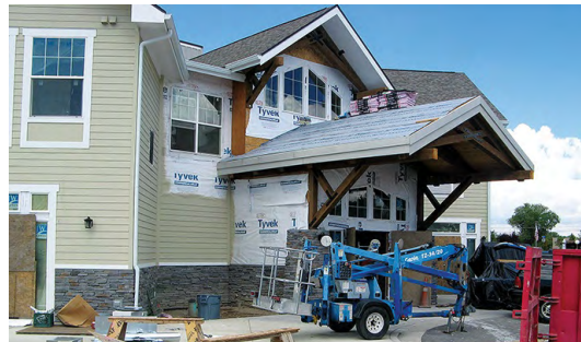
Cappella Grand Junction

Leads Groups, Sunrise Seminars, a Health Care Summit, JUCO Spirit Week and a host of other instructional and networking opportunities will be offered to businesses so they can work smarter, not harder to develop their businesses and create jobs which helps everyone prosper.