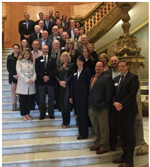
2017 Legislative Trip Participants