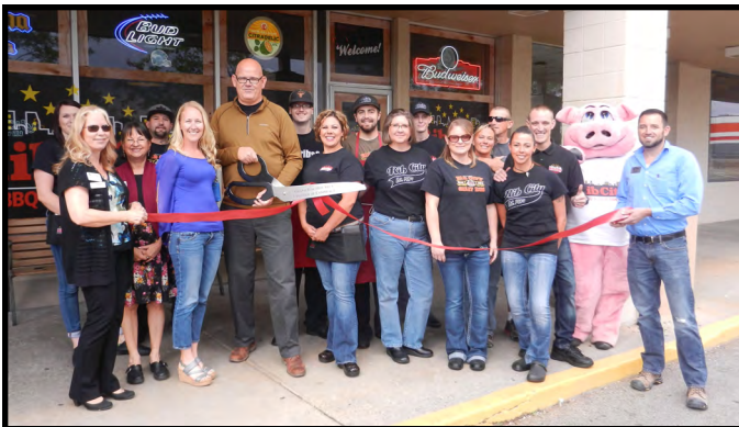
Rib City Grill 2830 North Avenue, Grand Junction, CO 81501 (970) 255-7330 - Business Expansion Restaurants