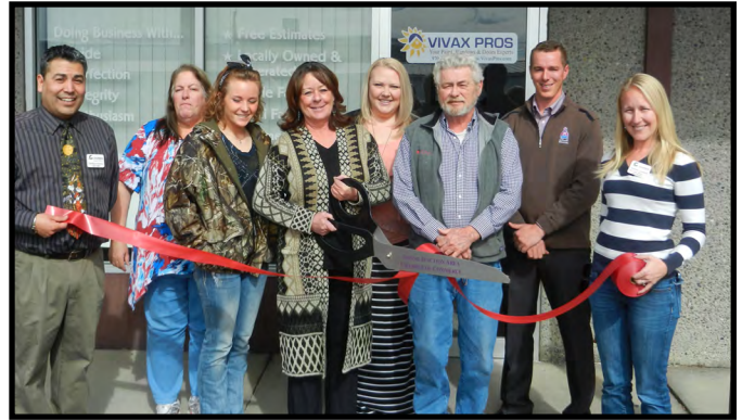
Vivax Pros 591 25 Road, Grand Junction, CO 81505 (970) 216-2330 - New Location Painting Contractors