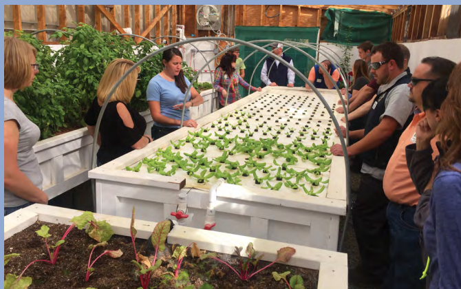
Water in the West

View more information or complete an application online at www.gjchamber.org . The cost is $1,050 for the entire session including overnight trips.