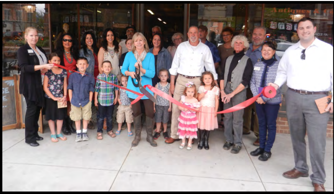
Brick & Mortar Mercantile 510 Main Street, Grand Junction, CO 81501 (970) 985-4244 - New Business Retail