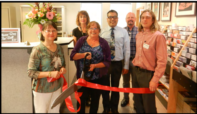
Flower Extraordinaire (970) 216-6764 - New Business Florist