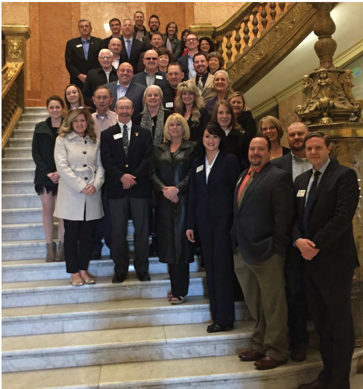
2017 Legislative Trip Participants