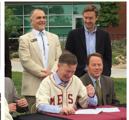
Colorado Rural Jump Start Bill Signing