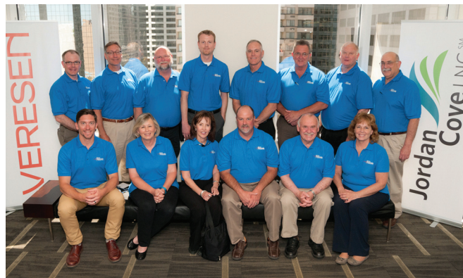
Global Petroleum Show 2015