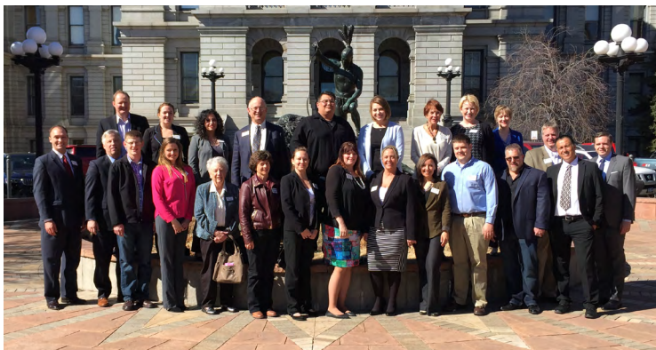
2016 Legislative Trip Participants