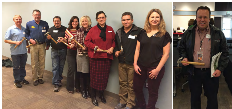
Congratulations to the 4th Quarter 2015 Business Expansion Award Recipients