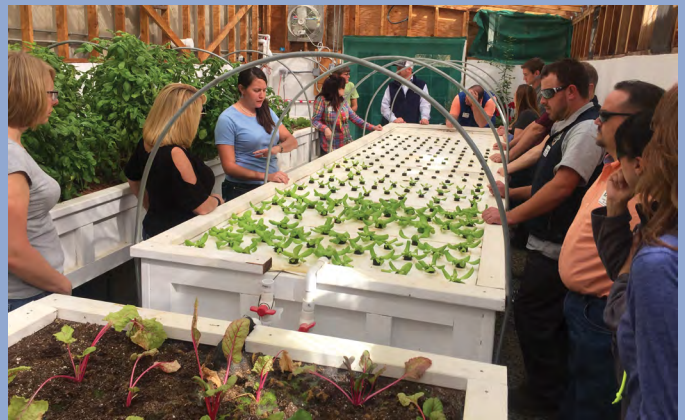
Water in the West

Over 250 outstanding local leaders have graduated from the program. Currently the Chamber is seeking applicants for the 2017-2018 class beginning in September 2017 and ending, May 2018. Applications are available online at www.gjchamber.org or if you'd like to discuss the program in greater detail contact Diane at the Chamber office, 970-242-3214. Deadline for applications is June 1st.