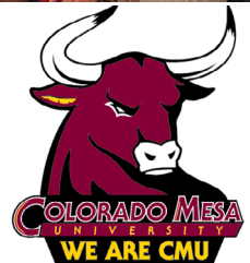
Colorado Mesa University Career Services Ribbon Cutting