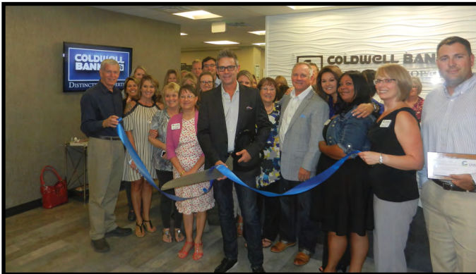
Coldwell Banker Commercial 131 N 6th St Ste 300, Grand Junction, CO 81501 (970) 244-6602 - New Location Commercial Brokerage