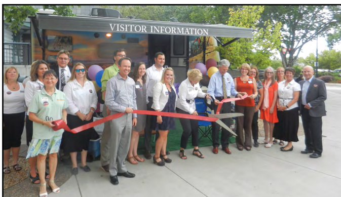
Visit Grand Junction 740 Horizon Dr, Grand Junction, CO 81506 (970) 244-1480 - Business Name Change Tourist/Visitor Information Center