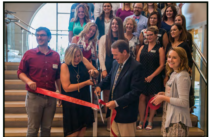
Colorado Mesa University Career Services