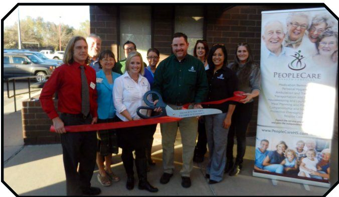
People Care Health Services 1565 Hwy 50, Grand Junction, CO 81416 (970) 874-0136 - New Business Health Services