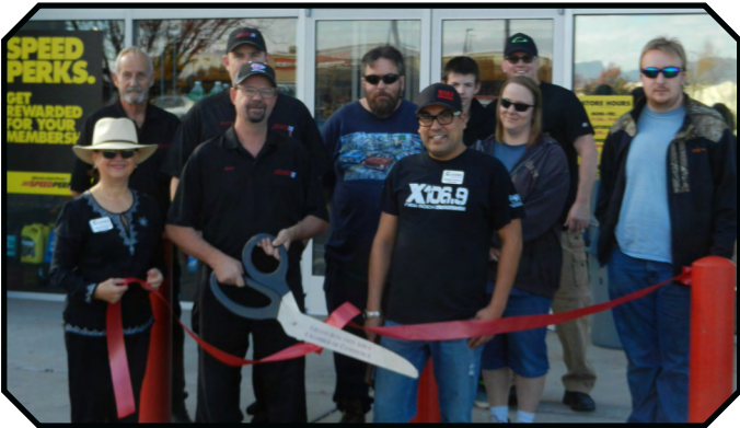
Advance Auto Parts 2469 Highway 6 & 50, Grand Junction, CO 81507 (970) 208-8075 - New Business Automotive: Parts