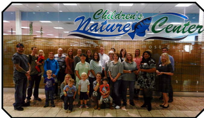
Children's Nature Center 2424 Hwy 6 & 50 (Mesa Mall), Grand Jct, CO 81505 (970) 241-1000 - New Location Aquarium · Science Museum · Zoo