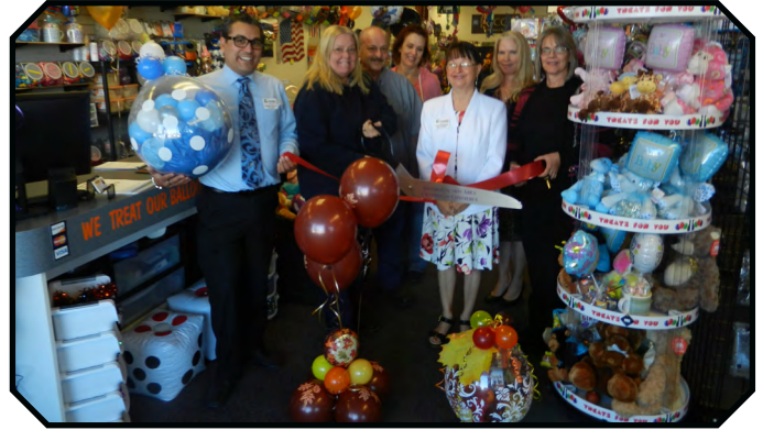
Balloons Plus by Katz 2695 Patterson Road #14, Grand Jct, CO 81506 (970) 628-1025 - New Business Balloons & Party Supplies