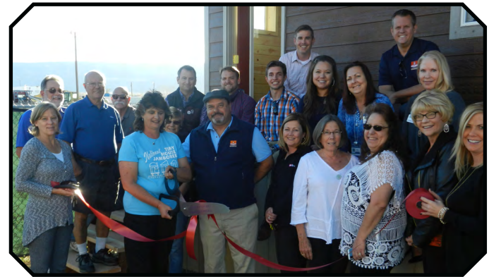
Junction West RV Park - Tiny Houses 793 22 Rd, Grand Junction, CO 815 (970) 245-8531- Business Expansion